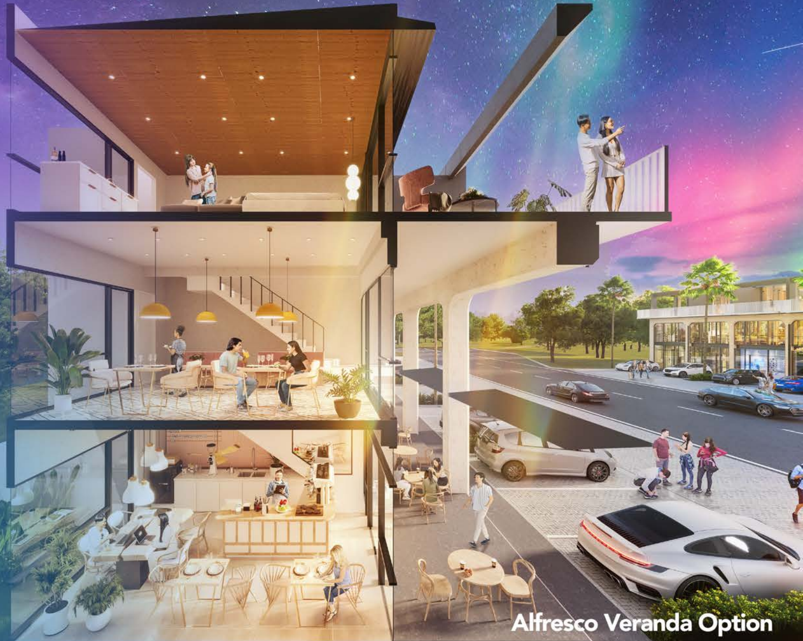
Alfresco Veranda Option